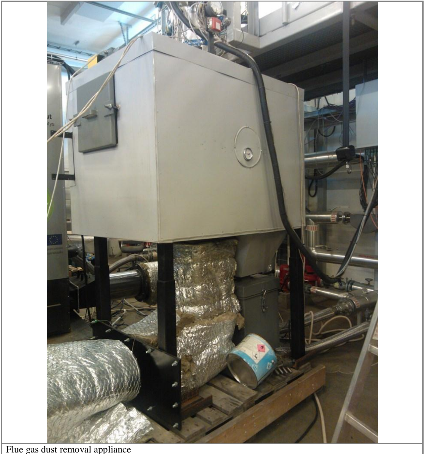
Flue gas dust removal appliance