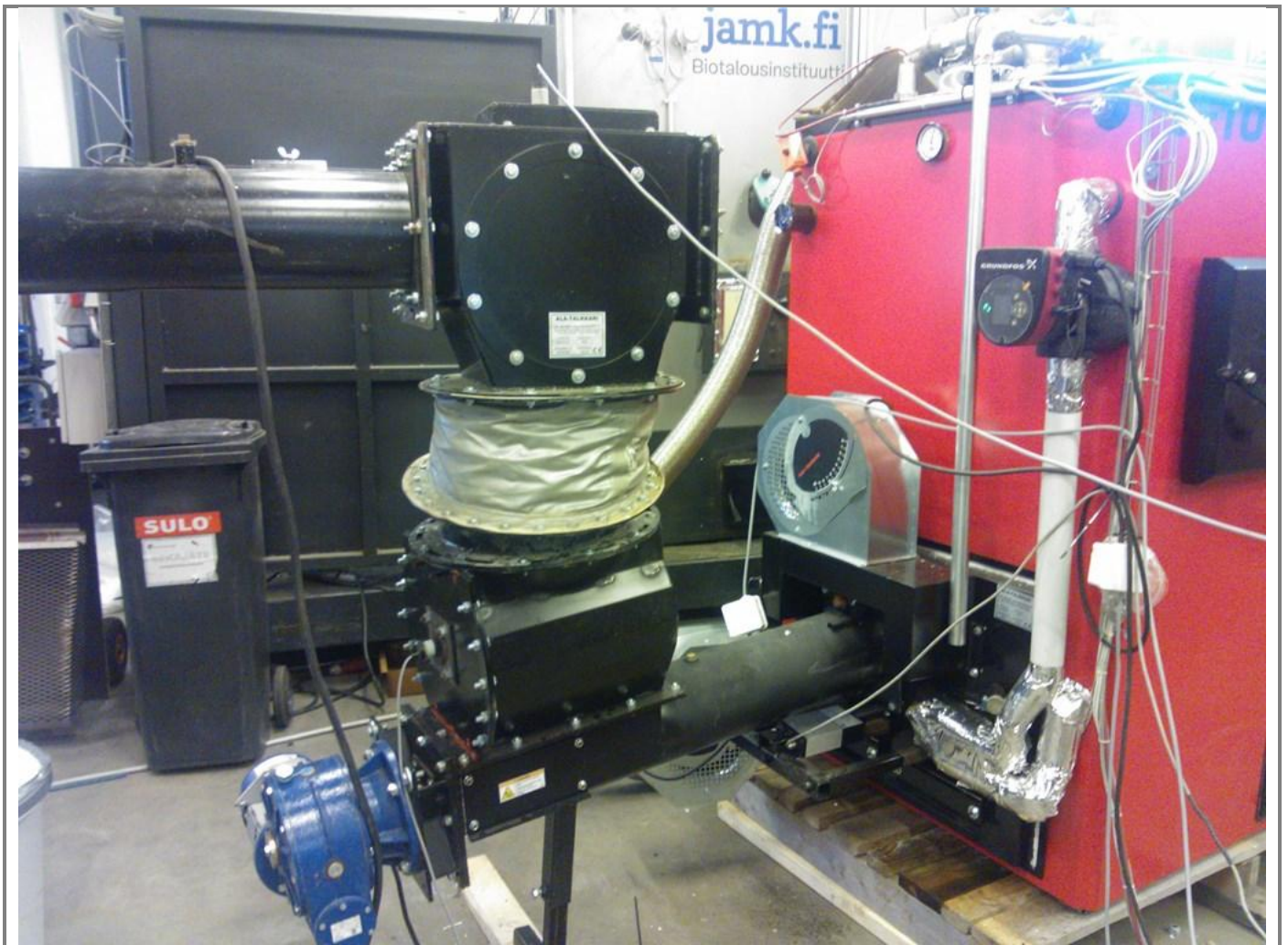
VETO 220 boiler